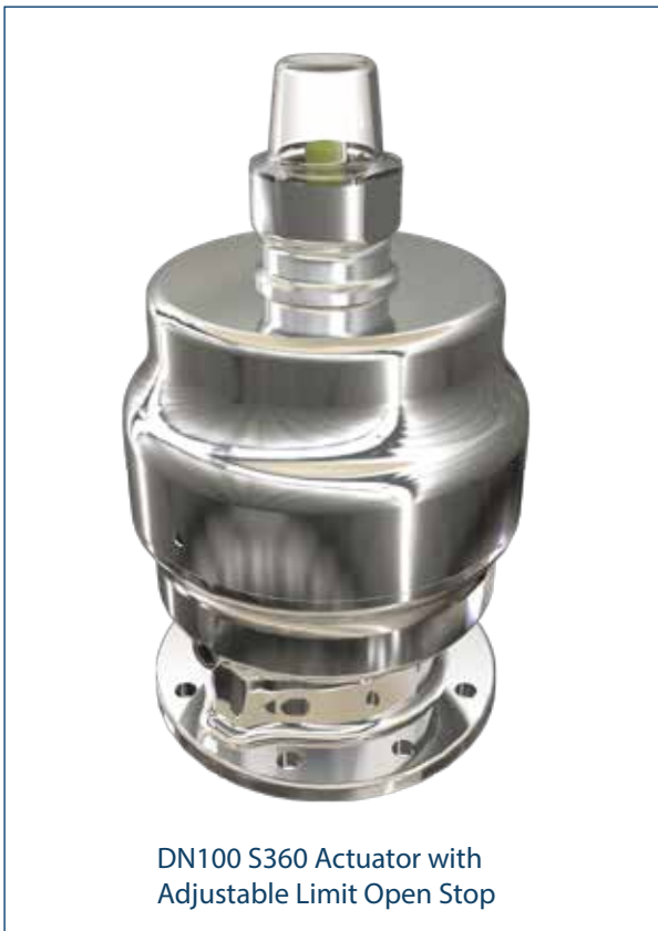
DN100 S360 Actuator with Adjustable Limit Open Stop