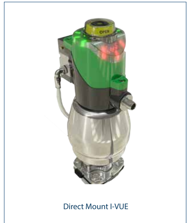
Direct Mount I-VUE

Visit www.saundersS360.com for additional information on other Saunders ® products, including technical datasheets, drawing library, and product selection tools.